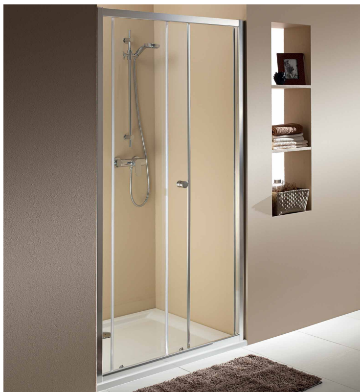
T4 sliding door